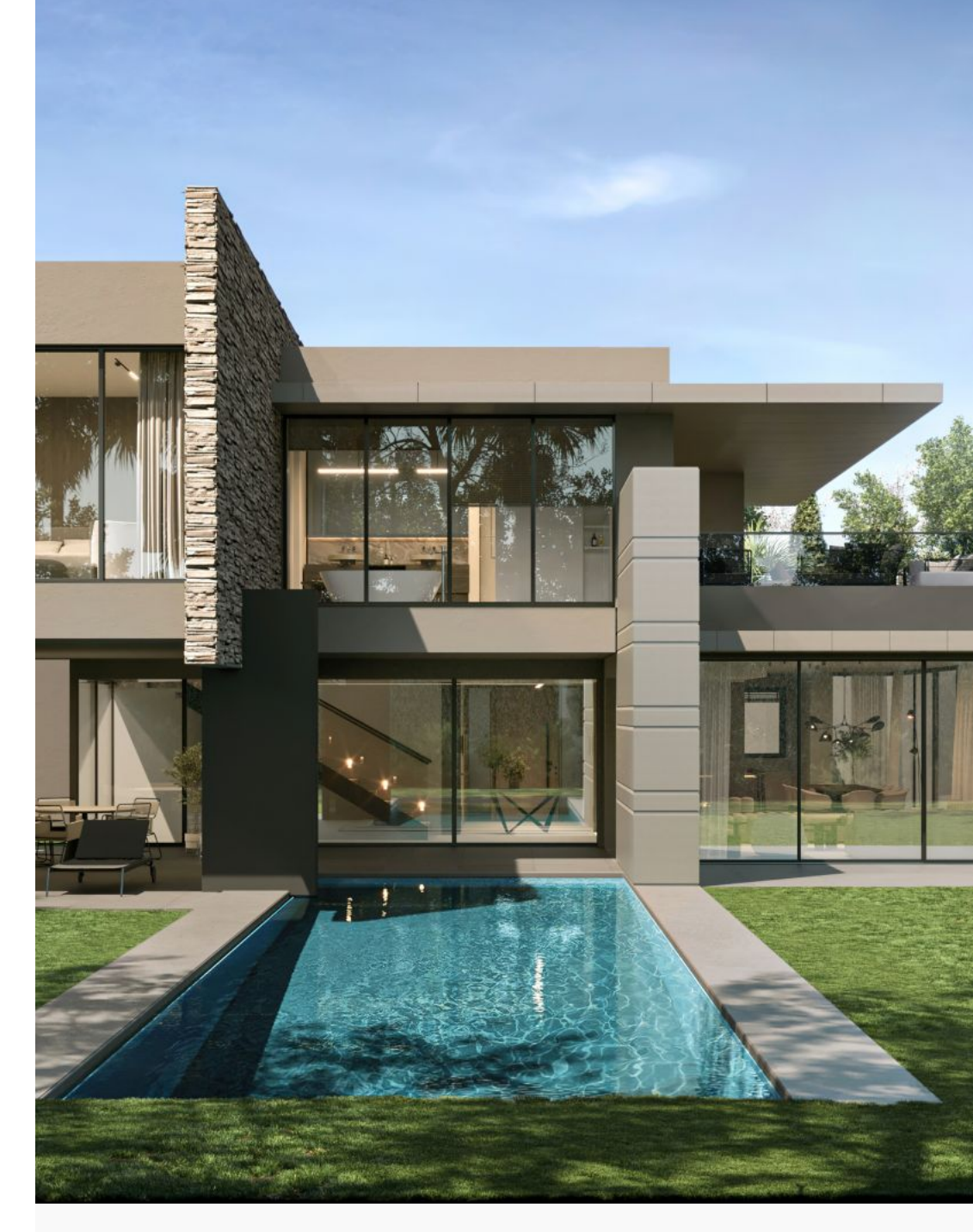
Sale price does not include costs or taxes. Additional costs for the buyer: inscription and notary fees, ITP 7% or, alternatively 10% VAT and AJD (1.2% on the purchase price) on new properties and subject to some requisites to be met. This info is subject to errors, omissions, modifications, prior sale or withdrawal from the market. Information sheet available, Decree 218/2005 Oct. 11th.